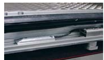
The EkeGuard locking system is built into the trailer structure.

in Finland and Sweden. Practice has also shown that EkeGuard has increased the safety of drivers and cargoes.